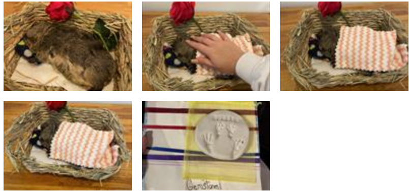
MendezLady - November 01, 2022 at 10:55 AM

“ Rest easy Shadow girl. May you run forever free in a field of hay and veggies.